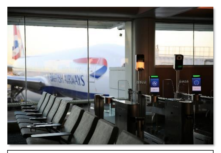
Figure 2. British Airways deployment of "eGates" facial recognition technology in partnership with CBP at Orlando International Airport.

operators and camera technology meeting CBP's technical specifications to capture facial images of travelers and use the TVS matching service for identity verification. Each camera is connected to the TVS via a secure, encrypted connection. While the photo capture process may vary slightly according to the unique requirements of each participating airline and airport the infrastructure authority, IT supporting the backend process is the same. Please see Appendix B for a full list of up-to-date CBP commercial partnerships and deployments.