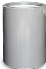
Figure 3-4 Blast Resistant Litter Bin BK/L-III