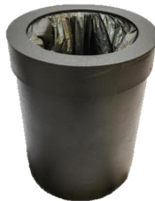
Figure 3-15 Halo 80 Plus