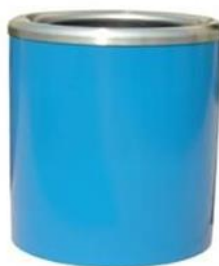
Figure 3-7 Universal Security Trash Receptacle