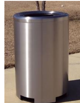
Figure 3-1 Guardian, Protector, and Defender models (all have same exterior appearance)

Installation and maintenance instructions are provided with every order and technical assistance on installation is available by email or telephone at no cost.