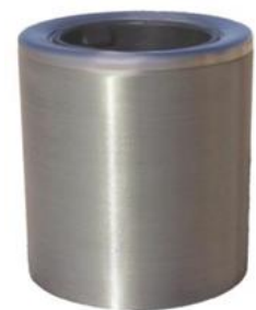
Figure 3-8 Infinity Security Trash Receptacle