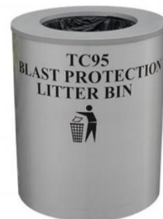
Figure 3-16 TC 95