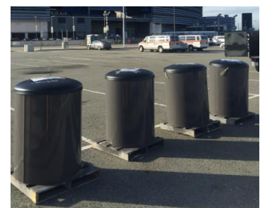
Figure 3-17 L1-L5 Model Series