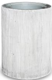
Figure 3-3 Blast Resistant Litter Bin BK/L-I

No information on prices or warranties was available at the time of publication of this report.