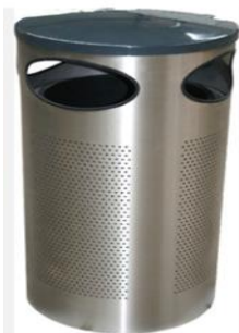
Figure 3-14 Halo 80 LA

The Halo 80 and TC95 models come with 12-month warranties; warranty information on other models, however, was not available at the time of publication of this report. Similarly, pricing information was not available for any model at the time of publication of this report.