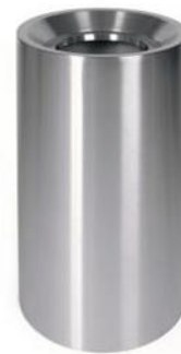
Figure 3-10 DynaKEEPR L4