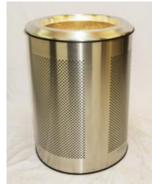
Figure 3-11 Halo 80

Energetics Technology, Ltd. (formerly Aigis Blast Protection, Ltd.) offers five BRTR models: Halo 80, Halo 80 LA, Halo 80 Plus, Halo 160, and TC95. All of them employ a proprietary SABREMAT (short for “shock attenuating blast resistant material”) technology to protect against blast effects. The manufacturer states the Halo 80 Plus withstands explosive charges more than double the size of those tested with the Halo 80 model. The blast resistance of all five models has been tested to the UK HOSDB test method; the Halo 80 Plus and TC95 earned 7-star HOSDB ratings. No information on the HOSDB star rating of the other three models was available at the time of publication of this report, nor was any information about whether the blast resistance of any of the five models has been evaluated according to ASTM standards.