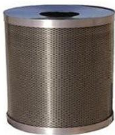
Figure 3-6 Decor Security Trash Receptacle

No information on prices or warranties was available at the time of publication of this report.