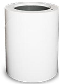
Figure 3-5 Blast Resistant Litter Bin BK/L-IV