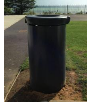
Figure 3-9 CIS Type 4180 Anti-Bomb Bin

No price or warranty information was available at the time of publication of this report.