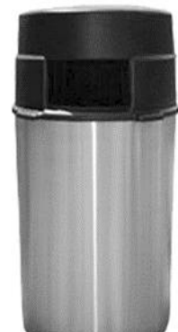
Figure 3-2 BlastGard MTR 91