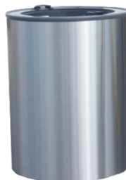
Figure 3-16 BCR L1-L5