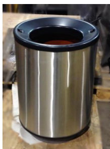
Figure 3-15 BCR X10

Mistral does not publicly disclose exact product prices without vendor contact. Prices of both the X10 and X20 models are less than $2,000. The L1 is between $3,000 and $4,000; the L2 and L3 are between $3,500 and $4,500; the L4 is between $4,500 and $5,500; and the L5 is under $6,000.