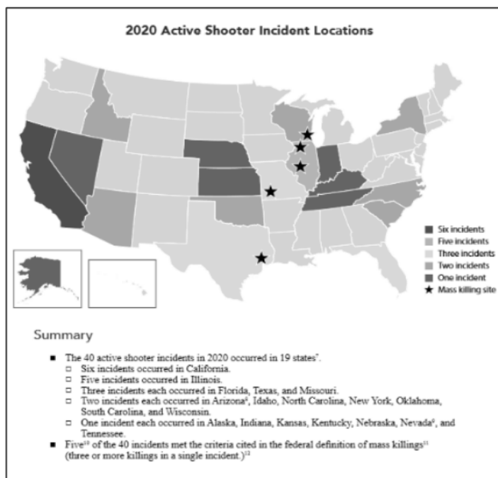
Figure 1. Active Shooter Incidents in the United States in 2020 (FBI)

Texas Governor Greg Abbott issued Executive Order Number GA-07 in September 2019, calling for improved systems to detect and deter future incidents of targeted violence and domestic terrorism. This order pointed out that in the cases of El Paso and Midland-Odessa, family members and neighbors of the attackers had expressed concerns about their pre-attack behavior, suggesting that these incidents might have been prevented and that “gathering and processing information about potential criminal or terrorist acts can lead to swifter action by law enforcement to prevent such acts, including mass shootings.” 1 The arrest and indictment of Oath Keeper founder Stewart Rhodes in Little Elm, TX in January 2022 on seditious conspiracy