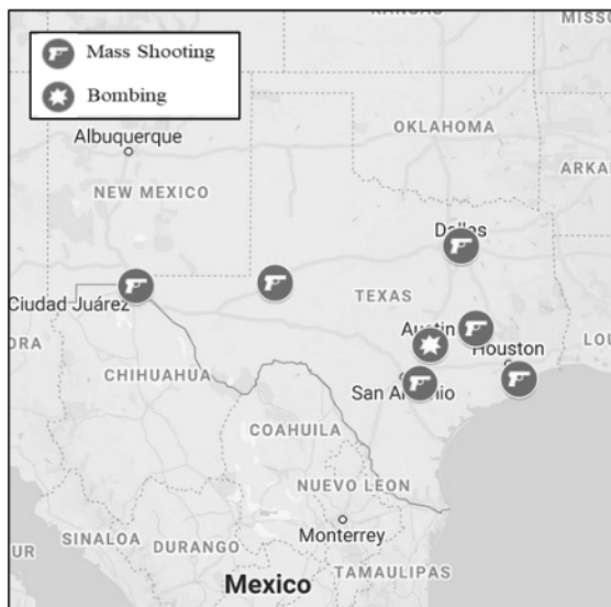
Figure 2. Locations of major targeted violence and domestic terrorism incidents in Texas since 2016

While domestic terrorism poses a real and persistent threat to the nation and the State of Texas, it also presents unique challenges for law enforcement seeking to counter this threat. Texas does require law enforcement agencies to report hate crimes. However, while hate crime charges could, by definition, rise to the level of domestic terrorism, they may represent only a portion of possible domestic terrorist actors and the crimes they commit. As Texans continue to experience