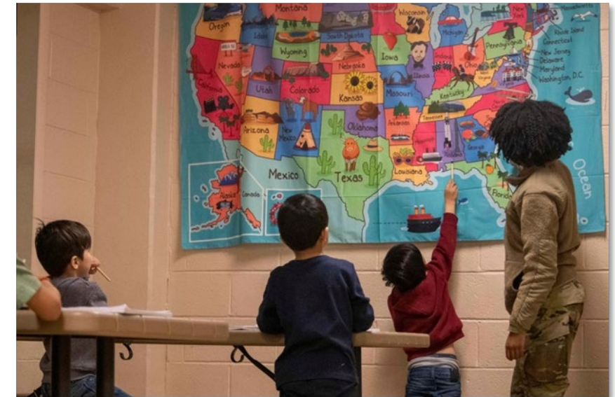
Afghan children learning the names of the 50 states in the U.S. at Joint Base McGuire-Dix-Lakehurst, New Jersey, Photo ID 7030815.