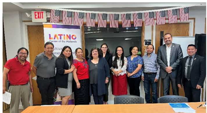
CRCL staff with representatives from the Latino Center of the Midlands in Omaha, Nebraska

In July and August, CRCL continued its outreach on the Department's first-ever draft DHS Indigenous Languages Plan . DHS recognizes the importance of effective communication with persons who are limited English proficient (LEP) across its many missions and functions and is committed to meeting the requirements of Executive Order 13166, Improving Access to Services for Persons with Limited English Proficiency . The Indigenous Languages Plan will serve as a vehicle for strengthening language services at DHS for Indigenous migrants of Latin America who are encountered and served in DHS programs and activities, an important effort given the increase in migration levels to the U.S. from countries with large Indigenous populations. The plan is also designed to support DHS front-line personnel in their interactions with Indigenous persons by providing resources such as improved protocols and methods for identifying the language spoken by Indigenous migrants. The plan was first developed after receiving input and recommendations from several U.S. Indigenous migrant community leaders and organizations, as well as DHS interagency partners.