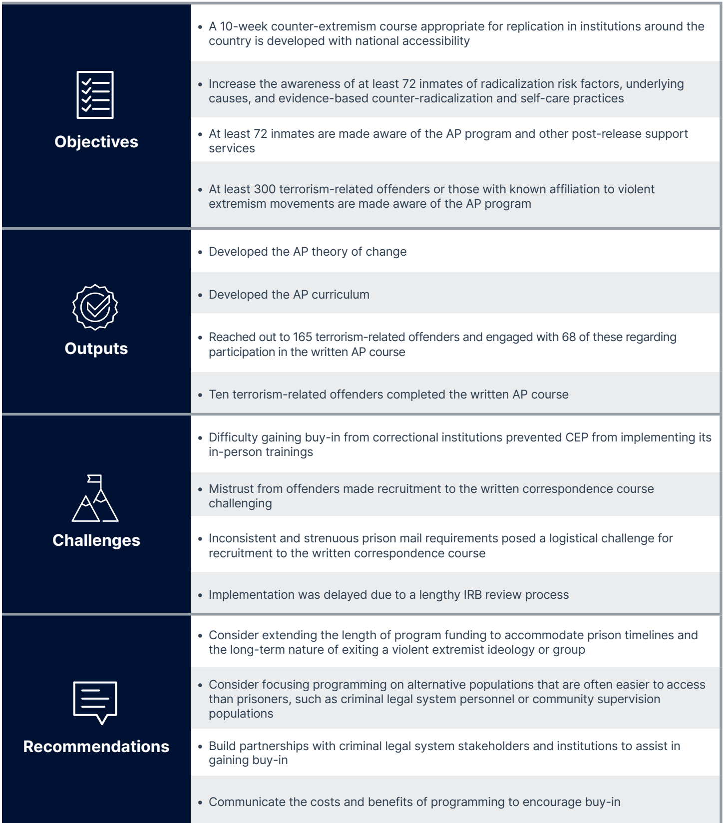
Table ES-A: Summary of Findings