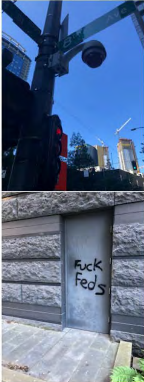
U.S. Courthouse 700 Stewart Street, Seattle, WA 7-19-2020