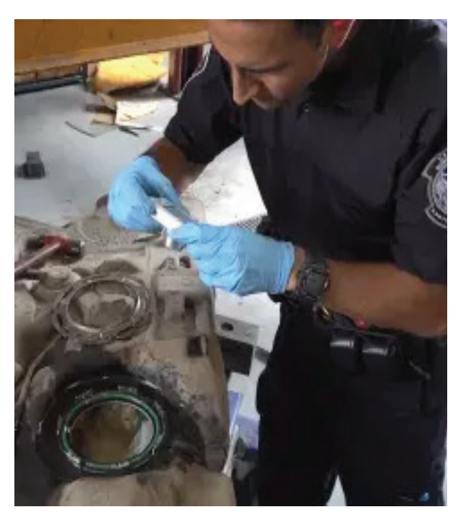
CBP uses AI to keep fentanyl and other drugs out of the country.

The term "machine learning" (as defined by DHS) means a set of techniques that can be used to train Al algorithms to improve performance at a task based on data.