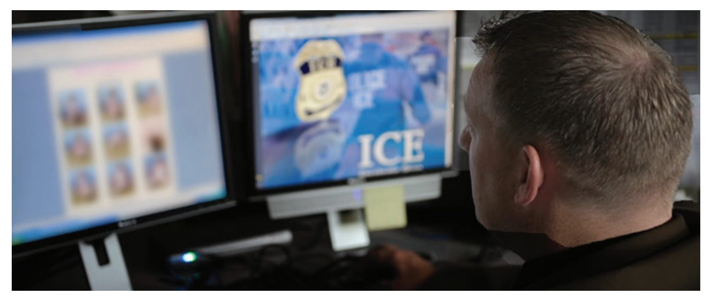
HSI uses AI to investigate heinous crimes.

for communicating Al-related threat and risk information, including to critical infrastructure sectors, and responsibly integrate Al software systems across DHS.