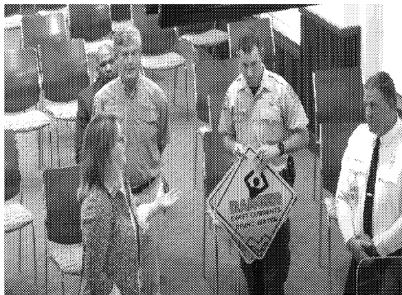
Presentation to Georgia City Council