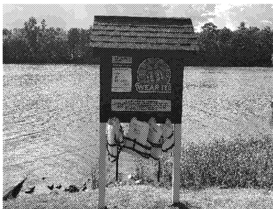
Safe Kids Columbus installed a new Life Jacket Loaner Station in July at Blanton Creek

In July 2022, Safe Kids Columbus installed its seventh loaner station at Blanton Creek in Georgia. They also distributed 85 life jackets through its loaner stations. Additionally, their River Safety Committee met on July 18th and the mayor asked the Committee to provide an update on open water safety in the area to the city council. The Committee meeting was recorded and televised on YouTube and the local government channel. The Committee proceeded to update the Georgia City City Council on July 26 th and that presentation was also made available on YouTube.