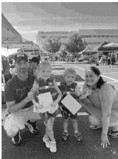
Safe Kids Austin (TX) hosts Summer Safety Fest in the city of Kyle. The event provided open water and boating safety information to families as well as life jackets, in addition to other summer safety topics.