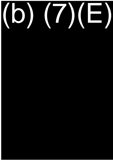
Figure #2: Pedestrian Fence Start Location