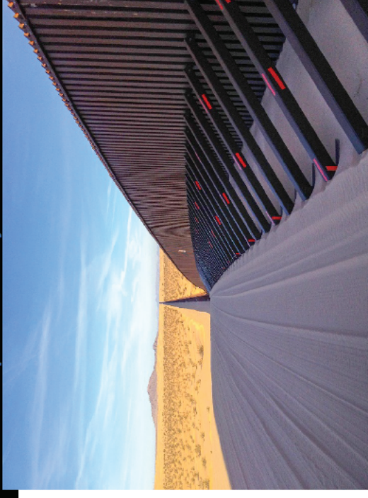
Yuma Border Wall

PAE Assessment: Program in steady state, monitoring staffing challenges and funding; OIA has requested org changes which may help address staffing needs for TI.