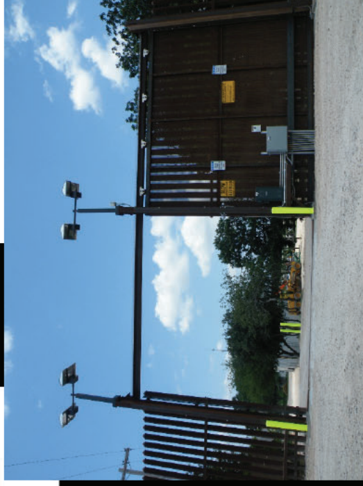
Gate in Rio Grande Valley