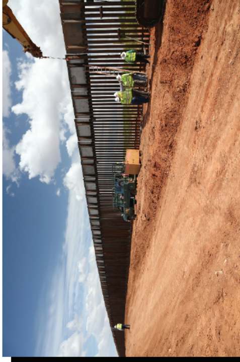
Naco Wall Replacement Project

The purpose of the pedestrian and vehicle barrier is to impede and deny illegal cross-border activity by slowing, delaying, and acting as an obstacle to the adversary.