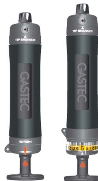
Figure 3-4. Gastec GV-100 and GV-110 Piston Pumps

The GV-100 MSRP is $350 and GV-110 MSRP is $400. The pumps are shown in Figure 3-4 with the GV-100 on the left and the GV-110 on the right. They are manually operated piston pumps with 100 mL stroke and half stroke capability. They have integrated tube-tip cutters. Both pumps have end-of-stroke indicators. A stroke counter for up to 10 strokes is available for the GV-110 as a MSRP $250 accessory. The pumps include a thermometer that displays ambient temperatures at 9°F intervals from 32°F to 104°F.