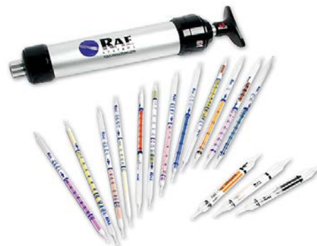
Figure 3-6. RAE Systems LP-1200 Piston Pump and an Assortment of Tubes

The LP-1200 is available as a kit, which costs about $200 and includes the pump, 2 spare inlet filters, a spare rubber inlet, a spare plunger gasket, and a carrying case.