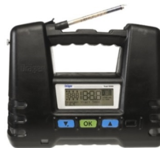
Figure 3-3. Draeger X-Act 5000 Automatic Pump with Tube Inserted

The Draeger X-act 5000 Pump MSRP is $1,825 and is shown in Figure 3-3. It is a battery-powered pump that permits hands-free operation. It is programmable up to 199 strokes. It is designed to be used with Draeger short-term tubes and reads barcodes on the tubes to automatically determine the required flow rates and volumes for each specific tube. Pump components are corrosion resistant.