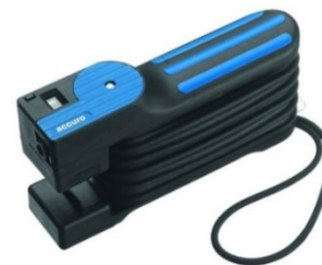
Figure 3-2. Draeger Accuro Bellows Pump