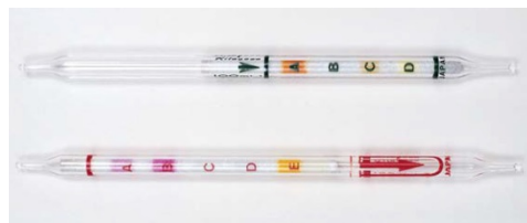
Figure 2-3. Multi-layer Tubes Used to Determine the Chemical(s) Present

PCT technology for quantifying concentrations of chemical vapors has been commercially available for many years. Tubes from different manufacturers are similar, though not exactly the same. Manufacturers recommend that tube holders and pumps are matched with tubes of the correct diameter from the same manufacturer. Recent advances include additional chemicals that can be detected, the availability of new pumps, development of multi-tube samplers (discussed above and shown in Figure 2-2), tubes with barcodes that can be read by programmable pumps for simpler fielding and chemical quantification, and multi-layer tubes for the simultaneous qualitative or semi-quantitative detection of the presence of multiple chemicals (discussed above and shown in Figure 2-3).