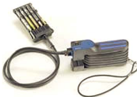
Figure 2-2. Multi-tube Sampler Showing Five Tubes in the Holder

Some manufacturers provide tube holders that can connect multiple tubes (as pre-selected kits) to one pump, allowing for the detection and quantification of several chemicals at the same time (Figure 2-2). Multi-layer tubes (Figure 2-3) for qualitative identification of unknowns (i.e., to determine the presence of multiple chemicals but not the concentration) are available from a few manufacturers. The multi-layer tubes shown are used in pairs. Both tubes are exposed and the patterns resulting in specific regions are used to determine which chemical(s) may be present. Once an unknown chemical has been identified using the multi-layer tubes, the relevant chemical-specific tube(s) can be selected for quantitative measurements.