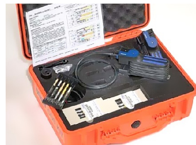
Figure 3-1. Draeger Civil Defense Simultest (CDS) Kit

The Draeger Accuro Bellows pump MSRP is $440 and is shown in Figure 3-2. It is a manually operated bellows pump with a 100 milliliter (mL) stroke. It allows for one-hand operation. The pump includes an end-of-stroke indicator and an automatic stroke counter. The pump has an integrated tube-tip cutter.