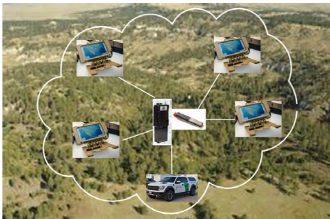
Real-time Situational Awareness using MANET Technologies

During an emergency, first responders need timely and relevant data to make informed decisions. Land Mobile Radio networks are intended for voice communications and do not have the capacity to transmit large amounts of data. Commercial cellular networks can become overloaded or fail completely, as the network becomes saturated by public use. This leaves public safety agencies competing for the same network resources when trying to transmit their mission-critical information, especially video. Further, in rural areas lacking the needed critical communications infrastructure, first responders rapidly become disconnected and lose their situational awareness.