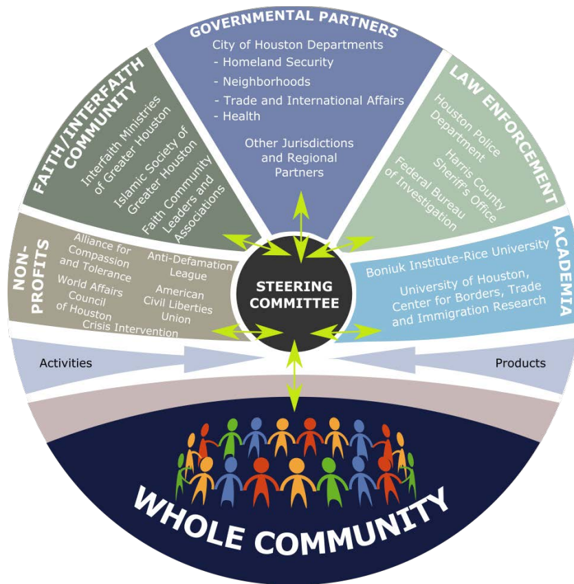
Figure 1: Houston Regional CVE Steering Committee – Committed Partners