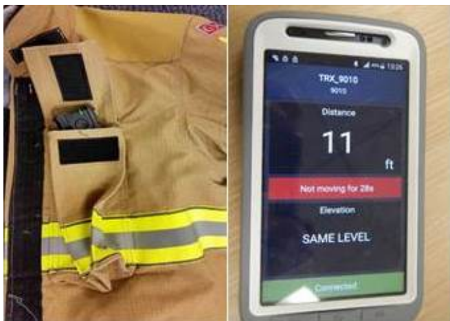
Responders wear a beacon that is detected via handheld application

The Department of Homeland Security (DHS) Science and Technology Directorate (S&T) developed a solution, the Firefighter Accountability and Proximity System (FFAP), which allows responders to quickly hone in on a colleague in distress. The FFAP approach leverages existing time-of-flight tracking developed by S&T's commercial partner, TRX Systems, Inc, and is being sold commercially as NEON-P®. This technology has been tested in fire conditions and is used in several other technologies, including DHS's Geospatial Location Accountability and Navigation System for Emergency Responders.