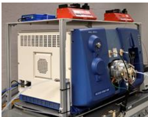
The MIT LL training aid provides measurement in real time

The K9-TACT service will be performed by MIT Lincoln Laboratory (MIT LL) under the DHS S&T Detection Canine Program. With DHS S&T guidance, MIT LL has developed a real-time vapor measurement capability to assist the DHS S&T Detection Canine Program in meeting its goals to better understand and train the explosive detection canine teams.