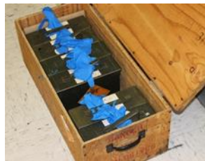
Sample canine training aids