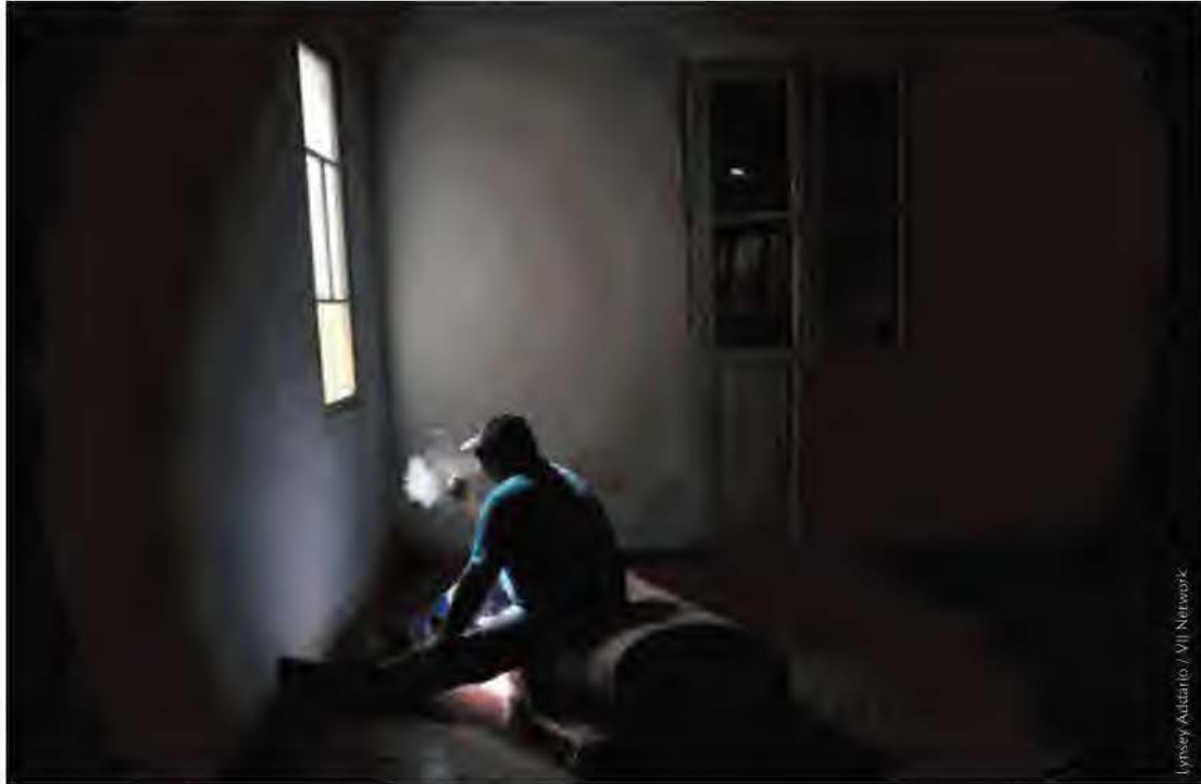
Homosexual Iraqi 'samiri' poses for portraits in the empty apartment where he is staying in an undisclosed location in Sept. 10, 2009. After being tortured in Iraq, many Iraqi homosexuals are seeking refuge. Original Caption.

In addition, advocates from the region argue that the presence of the occupying forces led many LGBTI individuals to believe that society would be freer and encouraged them to be more public with their sexuality, only to be subsequently targeted by violent extremists for advocating for their rights and left unprotected. 632