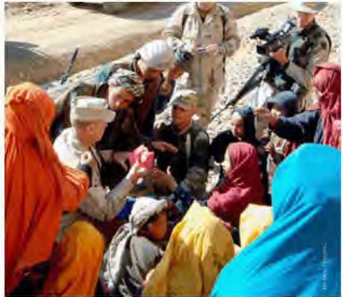
U.S. civil affairs soldiers based with a Provincial Reconstruction Team (PRT) hand out humanitarian relief to local Afghans in Bamian province in this picture taken March 26, 2003. Modified Caption.

In particular, CHRGJ's Stakeholder Workshops (especially in the United States, Africa, and MENA) and interviews with USAID officials in Asia, Africa, and Washington, D.C., emphasized that the U.S. military: fails to consult with stakeholders (including, in some cases, USAID); prioritizes projects with quick impact over long-term gains; is not familiar with gender concerns; lacks transparency and accountability in its disbursement of development funds; fails to ensure the longevity in its staff that is essential for understanding local gender dynamics and gaining trust of women; undermines the good work and reputation of other USG agencies in the field; and is inherently more concerned with security than humanitarian objectives. 402 In the words of one USAID official: "In Afghanistan, in their [the military's] eagerness to do something, they are not looking at power structures. They are empowering the wrong people. They are doing development but they don't know how." 403