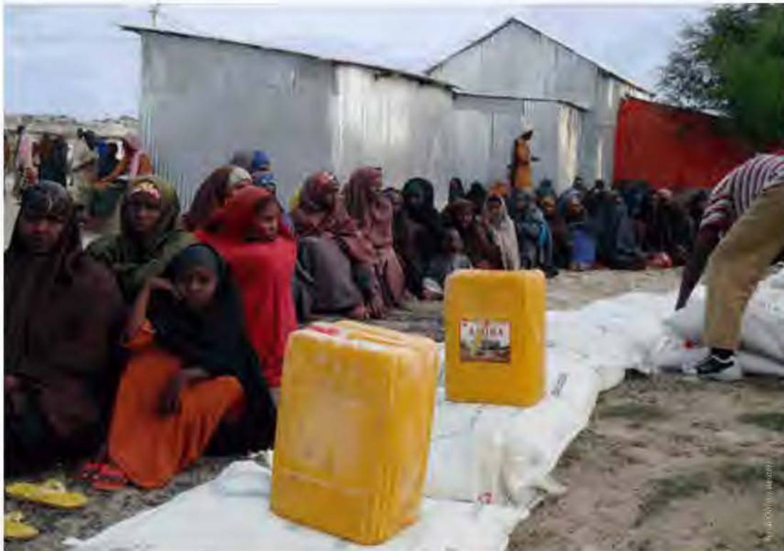
Somali women and their children queue to receive relief food from the hardline al-Shabab/Islamist rebel group outside the Somalia capital Mogadishu August 12, 2010. Original Caption

WFP, as of September 2009, half the population of southern and central Somalia was in need of food aid and “getting help to them inevitably involves dealing with al-Shabab and other hardline groups now in control of the towns and villages across the region.” 864 In January 2010, the WFP temporarily suspended its food aid distribution program in the southern parts of Somalia because of “growing insecurity and threats and unacceptable demands from Al-Shabaab.” 865 As of May 2011, the WFP has not resumed operations in Al-Shabaab-controlled areas and will not do so until Al-Shabaab revokes its ban on the WFP, retracts its conditions, and enables the WFP to verify this and provide unimpeded access. 866