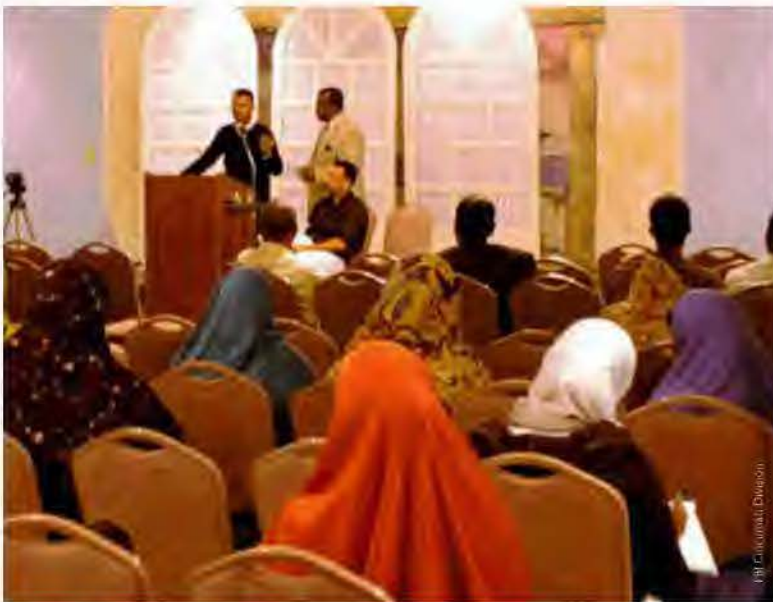
The FBI Cincinnati Division—in partnership with the U.S. Attorney’s Offices for the Northern and Southern Districts of Ohio along with the Columbus Police Department—recently hosted a radicalization awareness presentation for more than 100 members of the Somali community, including students, parents, and community leaders. Original Caption

In terms of the link between community engagement and countering violent extremism, on the one hand the USG explains that engagement empowers communities to become resilient to violent extremism and Al-Qaeda ideology 914 and “build[s] trust and open[s] a constructive dialogue with American Arab, Muslim, Sikh, Somali, and South Asian communities, to name but a few.” 915 Such activities include the