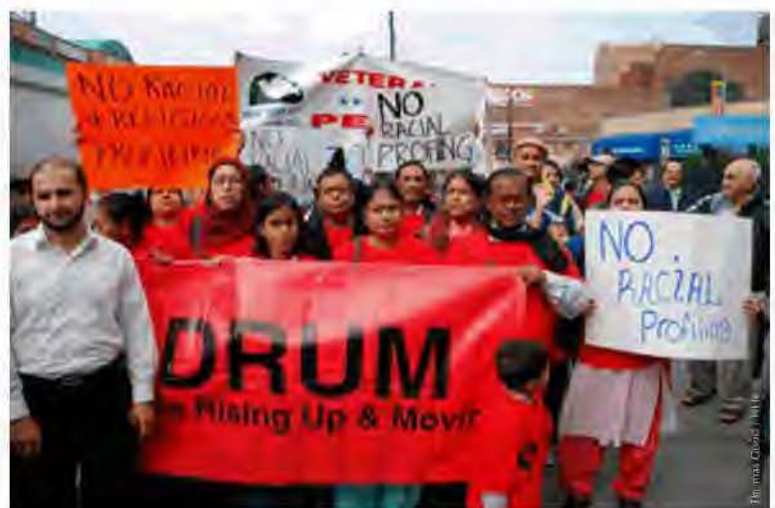
DRUM: Deis Rising Up and Moving outside the Flushing Public Library. Original Caption.

The use of U.S. immigration law as a counter-terrorism measure in the United States has by and large explicitly and predominantly focused on males in MASA communities. For example, the now-suspended 1156 National Security Entry and Exit Registration System (NSEERS) program specifically required male non-immigrants older than sixteen from “countries of interest” (mostly Muslim or Arab countries) to register with the then-INS. 1157 The human rights impacts of this focus are pervasive. In part, this