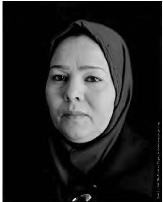
A divorced mother of seven and an accountant in Baghdad, she was detained by the U.S. Government in Iraq, January to July 2004, and released without charge: “They put me in a room and they put my son in a cage in front of me.” The soldier said to her: “Confess that you know terrorists or I will send you to a place where they will rape you. They will do things to you that you could never imagine.” Modified Caption