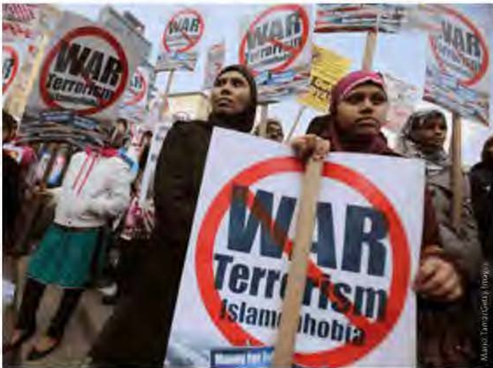
Muslim protesters gather at a large anti-war rally in Union Square on April 9, 2011 in New York City. Thousands of protesters called for the U.S. to end the wars in Iraq and Afghanistan and a large Muslim contingent protested against war and Islamophobia. Original Caption

the potential gendered impacts of the USG's present emphasis on women and national security.