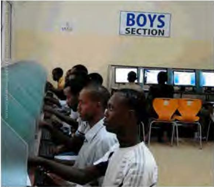
The USAID-funded Garissa Youth Project in Kenya created a Career Resource Center at the local library in order to provide a safe space for youth where they can find up-to-date career information and obtain basic IT skills. (Original Caption)

purpose, funding, and USAID/Kenya's characterization of the program, neither EDC nor USAID/Kenya acknowledges G-Youth's counter-extremism objectives when interacting with local populations. 471