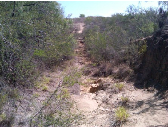
Illustration 3. Depicts big arroyo