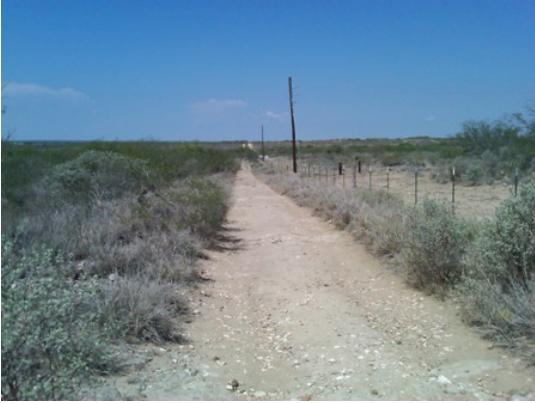
Illustration 2. Towards the Eastern Terminus of Fronton

[Electronically insert a photo showing the project infrastructure. A single photo less than a half of an 8.5" x 11" page is preferred. High resolution photos are unnecessary and generally each photo should be 100-300 kb in size.]