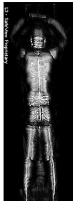
Millimeter wave image

While the equipment has the capability of collecting and storing an image, the image storage functions will be disabled by the manufacturer before the devices are placed in an airport and will not have the capability to be activated by operators. Images will be maintained on the screen only for as long as it takes to resolve any anomalies; if a TSO sees a suspicious area or prohibited item, the image will remain on the screen until the item is cleared either by the TSO recognizing the item on the screen, or by a physical screening by the TSO with the individual. The image is deleted in order to permit the next individual to be screened. The equipment does not retain the image. In addition, TSOs will be prohibited from bringing any device into the viewing area that has any photographic capability, including cell phone cameras. Rules