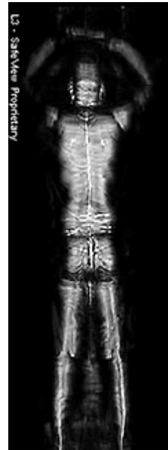
Millimeter wave image

While the equipment has the capability of collecting and storing an image, the image storage functions will be disabled by the manufacturer before the devices are placed in an airport and will not have the capability to be activated by operators. Images will be maintained on the screen only for as long as it takes to resolve any anomalies; if a TSO sees a suspicious area or prohibited item, the image will remain on the screen until the item is cleared either by the TSO recognizing the item on the screen, or by a physical screening by the TSO with the individual. The image is deleted in order to permit the next individual to be screened. The equipment does not retain the image. In addition, TSOs will be prohibited from bringing any device into the viewing area that has any photographic capability, including cell phone cameras. Rules governing the operating procedures of TSOs using this WBI equipment are documented in standard operating procedures (SOP), and compliance with these procedures is reviewed on a routine basis. Due to the sensitivity of the technical and operational details, the SOP will not be publicized, however, TSOs receive extensive training prior to operating WBI technology.